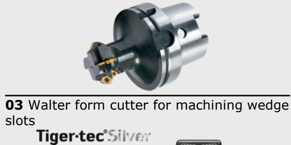
03 Walter form cutter for machining wedge slots