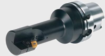
08 Walter back spot facing tool for machining coupling counter bores